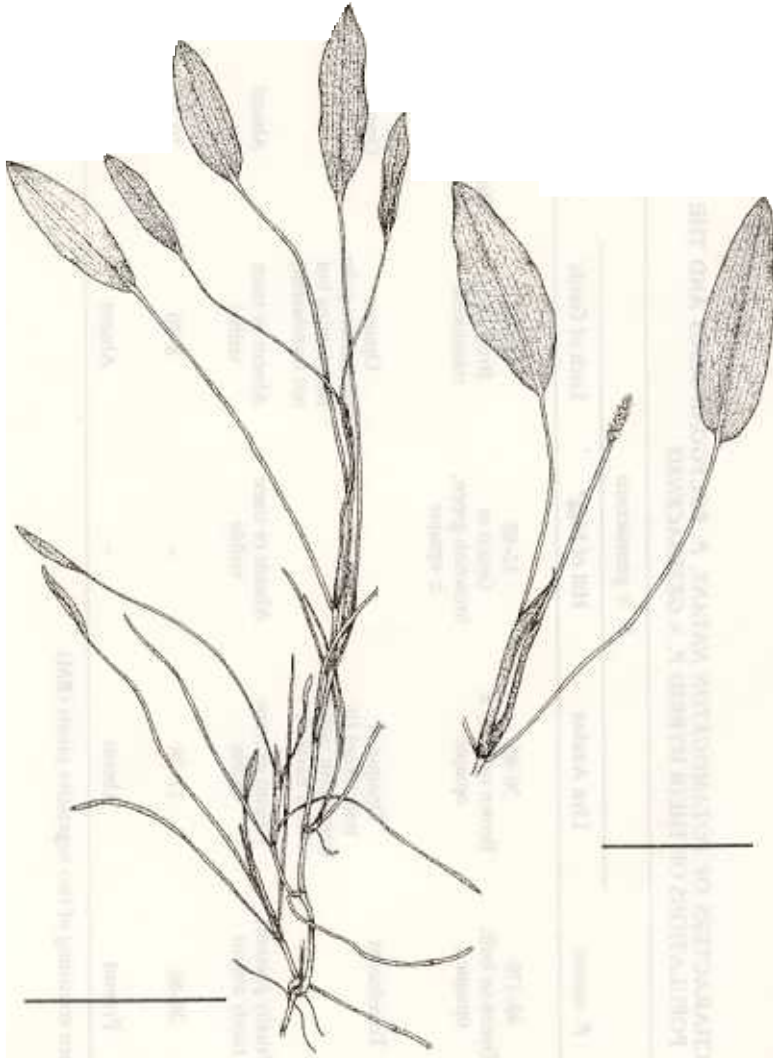
FIGURE 3. Potamogeton × gessnacensis , drawn by L. T. Ellis from herbarium specimens collected at Loch of Gards, Shetland, by C.D.P. & P.M.H. on 1 August 1996 (Preston 96/145, 146, CGE). Scale bars = 3 cm.

a form of that species . . . there were only four plants, all nearly the same, growing in a colony in the small streamlet at GR 28/828708. I had followed up the stream from the coast expecting to find the loch at approximately that locality, but to my disappointment it had completely disappeared, having become a “bog” full of moss, rushes etc., without even a pool of water left . . .”