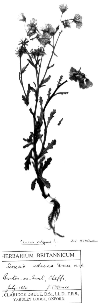
FIGURE 4. Herbarium specimen collected by G. C. Druce from Burton-on-Trent in July 1930, and described by the nomen nudum , Senecio advena (RNG). This specimen is a fertile intermediate hybrid of S. vulgaris and S. squalidus and possesses a number of morphological features in common with S. eboracensis , including ray florets, long achenes and dissected leaves – but see text for discussion.

S. squalidus and others may be segregating elements in a hybrid swarm or introgression sequence (Lowe and Abbott 2000). Certainly, not all herbarium specimens and botanical journal reports of hybrid individuals (including those labelled as S. advena by Druce) should be classified as S. eboracensis . However, it should be acknowledged that hybrids similar in morphology to S. eboracensis arise periodically when the two parent species occur together, and thus a polytopic origin for S. eboracensis would be feasible.