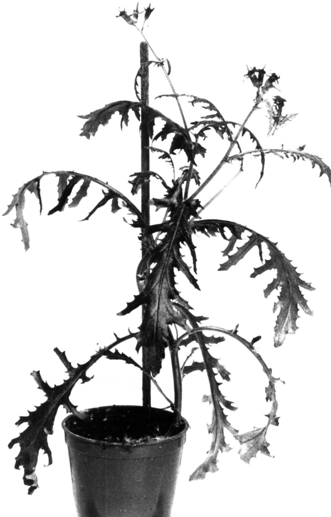
FIGURE 2. Senecio eboracensis raised under glass from seed collected at site adjacent to Lendal Bridge, York, in May 1991. Note the luxuriance of the leaves under high nutrient conditions.

open. Involucral bracts sparse (4–8), elongated (c. 3.5–4.0 mm), usually without black tips. Ray florets (6) 8 (9), bright yellow, with ligules narrow and long (c. 5.0–6.0 mm long and 1.5 mm broad), occasionally becoming revolute. Stigmatic papillae 10–30. Pollen grains in polar view c. 30–35 \mu\text{m} when fully expanded, mostly four-pored. Achenes 2.5–3.5 mm long, straight, shallowly grooved, with ribs glabrous and grooves hirtellous; pappus white, silky, readily becoming detached from the fruit. Fl. 4–10. Occurs on disturbed ground, car park perimeters, pavement cracks and other urban/industrial sites. 2n = 40 .