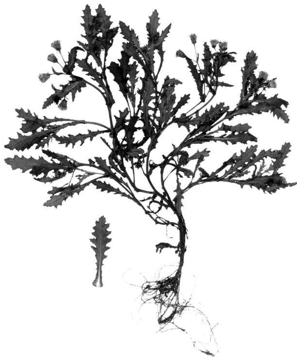
FIGURE 1. Pressed specimen of Senecio eboracensis collected from the south embankment of the River Ouse, adjacent to Lendal Bridge, York, in May 1991 (K: holotype).

Recent work by Lowe and Abbott (2000) has indicated that 'York radiate groundsel' is not likely to be a first generation tetraploid hybrid of S. vulgaris and S. squalidus , but is probably the product of backcrossing an F1 hybrid to S. vulgaris . Analysis of random amplified polymorphic DNA (RAPD) variation (Lowe 1996; James 1999) has shown that it contains significantly more genetic material derived from S. squalidus than does S. vulgaris var. hibernicus . In regard to